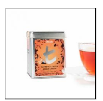
t-Series Supreme Ceylon Single Origin