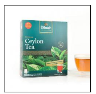
Ceylon Premium Tea