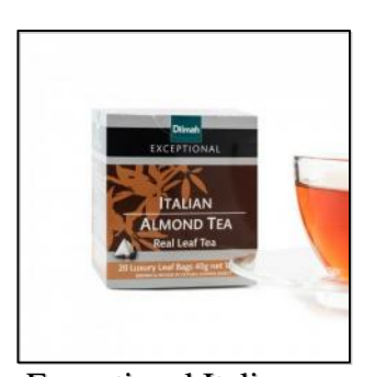
Exceptional Italian Almond Tea