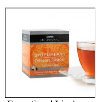
Exceptional Lively lime and Orange fusion