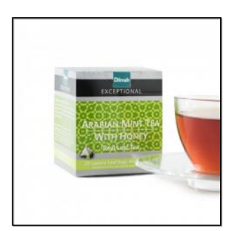
Exceptional Arabian Mint Tea with Honey