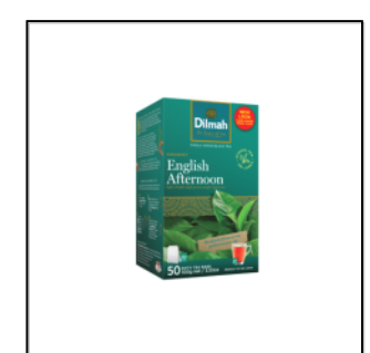
Gourmet English Afternoon