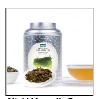
Vivid Naturally Pure Green tea