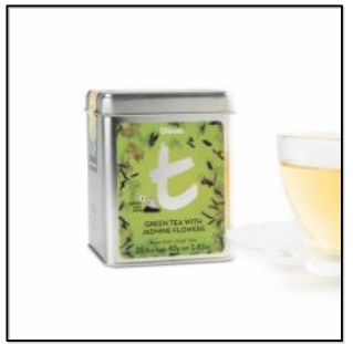
t-Series Green Tea