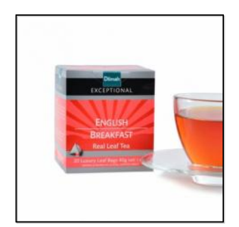
Exceptional English Breakfast