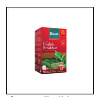
Gourmet English Breakfast