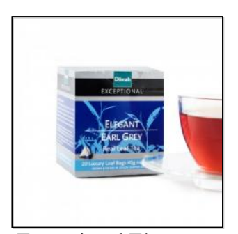
Exceptional Elegant Earl Grey