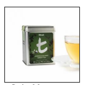
t-Series Moroccan Mint Green Tea