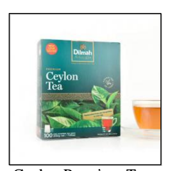
Ceylon Premium Tea