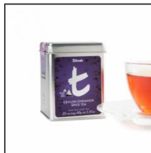
t-Series Ceylon Cinnamon Spice Tea