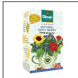
Natural Infusion Natural Spicy Berry