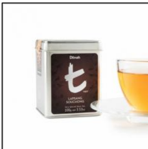
t-Series Lapsang Souchong