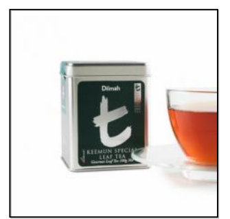
t-Series Keemun Special Leaf Tea