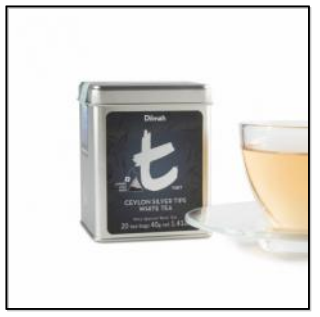
t-Series Ceylon Silver Tips White Tea