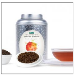
Vivid Ceylon Tea with Apple Pie & Vanilla