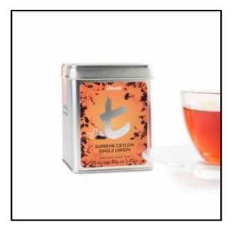
t-Series Supreme Ceylon Single Origin