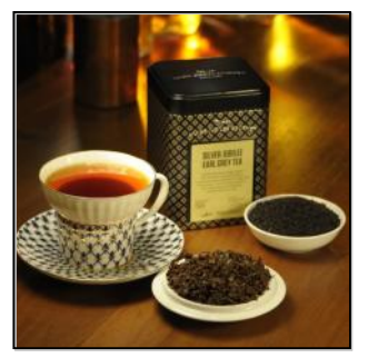
Silver Jubilee Earl Grey Tea