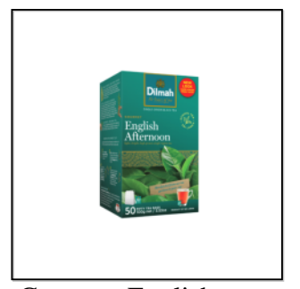
Gourmet English Afternoon