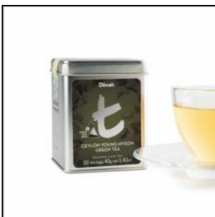
t-Series Ceylon Young Hyson Green Tea