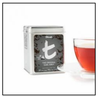
t-Series The Original Earl Grey