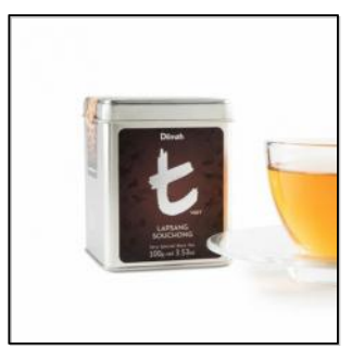
t-Series Lapsang Souchong