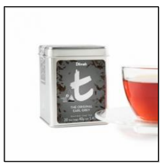
t-Series The Original Earl Grey