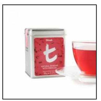
t-Series Natural Rosehip with Hibiscus