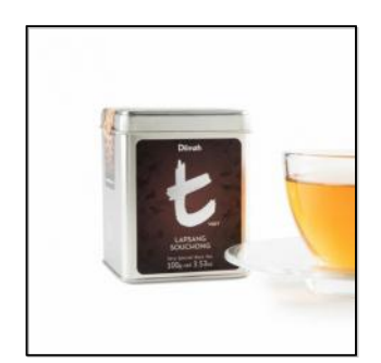
t-Series Lapsang Souchong