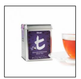
t-Series Ceylon Cinnamon Spice Tea