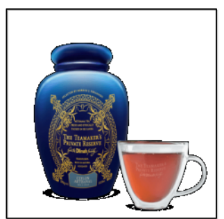
TPR Ceylon Artisanal Spice chai