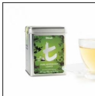
t-Series Pure Peppermint Leaves