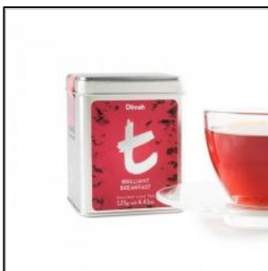
t-Series Brilliant Breakfast