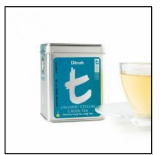
t-Series Organic Ceylon Green Tea