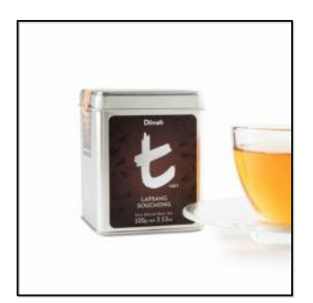
t-Series Lapsang Souchong