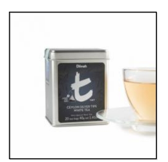
t-Series Ceylon Silver Tips White Tea