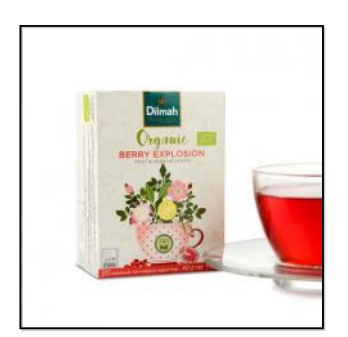
Organic Berry Explosion