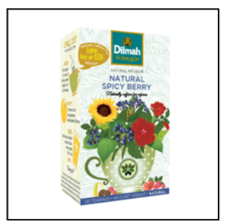
Natural Infusion Natural Spicy Berry