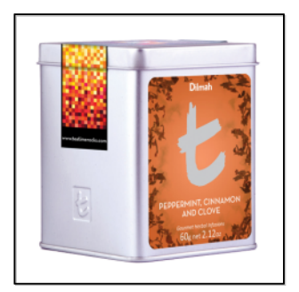
t-Series Peppermint, Cinnamon and Clove