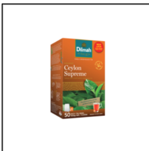
Gourmet Ceylon Supreme