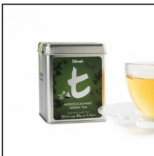
t-Series Moroccan Mint Green Tea