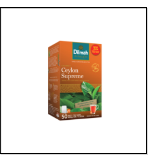
Gourmet Ceylon Supreme