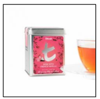
t-Series Rose With French Vanilla