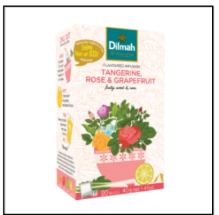
Flavoured Infusion Tangerine, Rose & Grapefruit