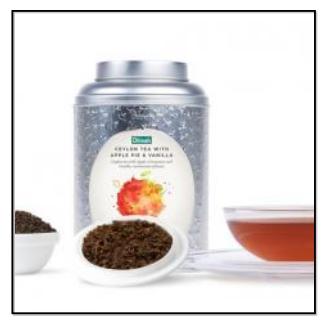
Vivid Ceylon Tea with Apple Pie & Vanilla