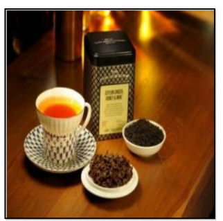
Silver Jubilee Ceylon Ginger, Honey & mint