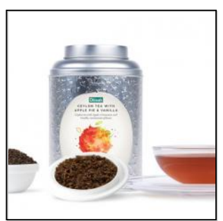
Vivid Ceylon Tea with Apple Pie & Vanilla