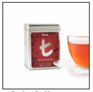
t-Series Italian Almond Tea