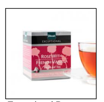
Exceptional Rose With French Vanilla