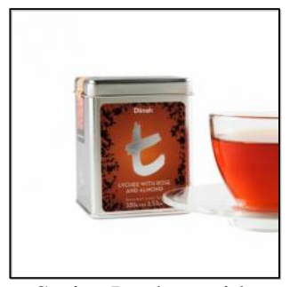
t-Series Lychee with Rose & Almond