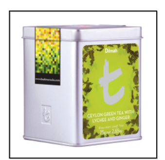
t-Series Ceylon Green Tea with Lychee and Ginger