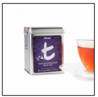
t-Series Ceylon Cinnamon Spice Tea