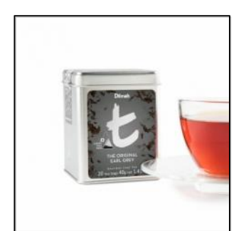
t-Series The Original Earl Grey