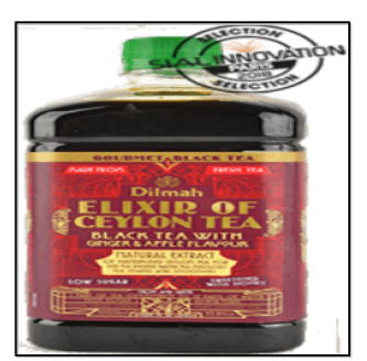
Elixir of Ceylon Tea Black Tea with Ginger and Apple