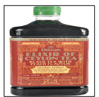
Elixir of Ceylon Tea Black Tea with Peach